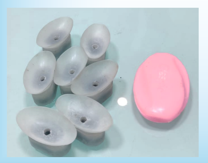
Soap Season Cups