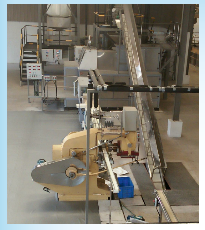
Automatic Soaps Stamping Machine