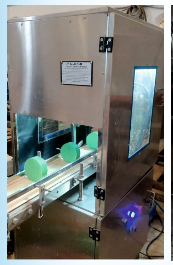
Dish Wash Cutting Machine