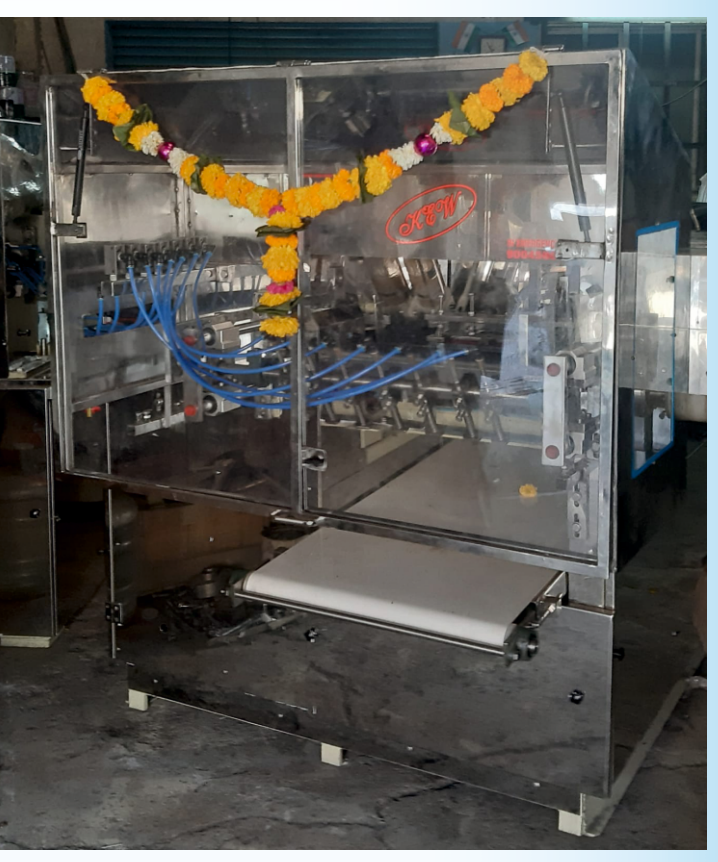
Pharmaceuticals Soap Stamping machine