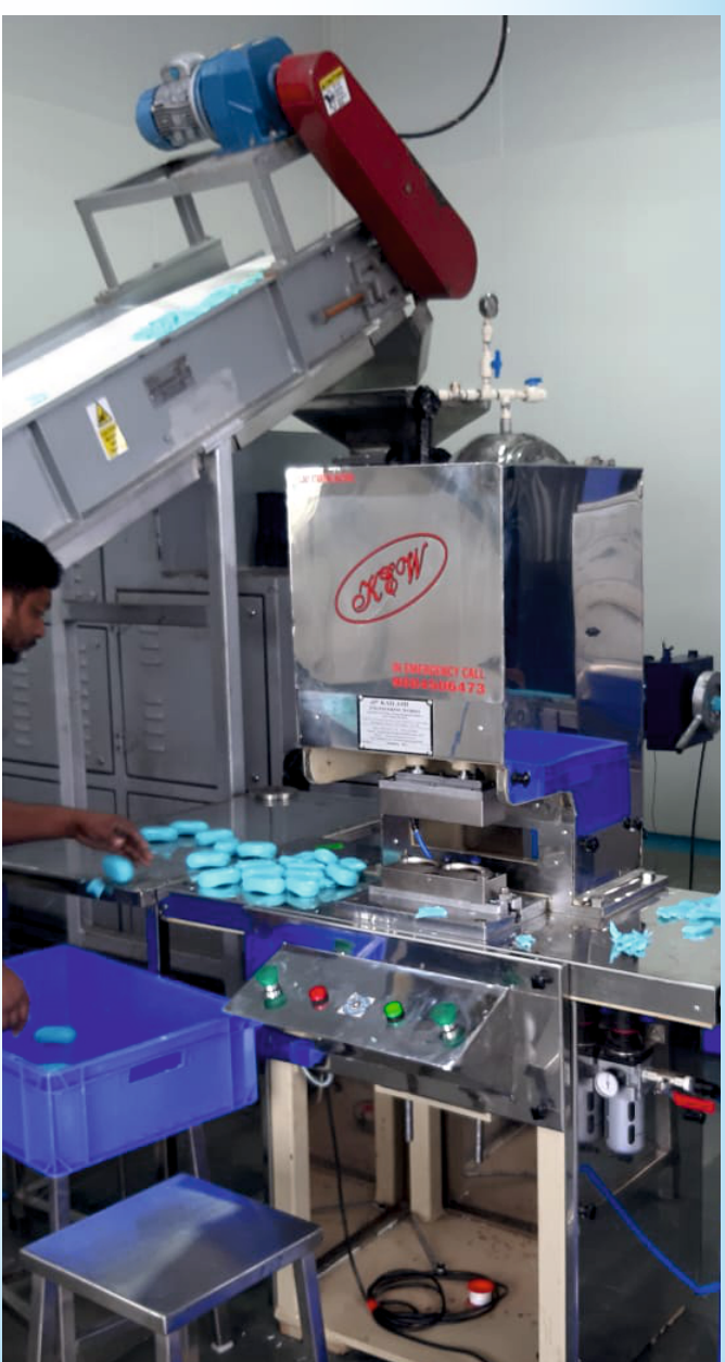
Pharmaceutical Pneumatic Manual Soap Stamping Machine