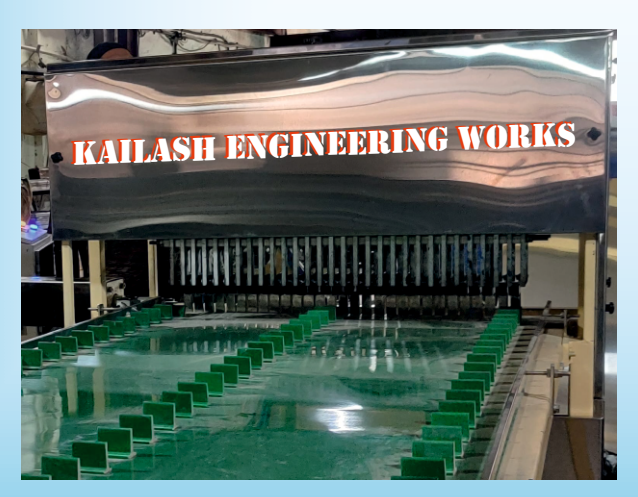
Automatic Transparent Soap Cutting Machine